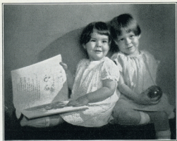
A Verito Portrait by Harris & Ewing

A better lens will make a better picture